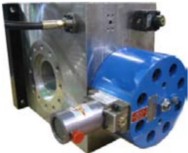
ex. 1600-ton Prince