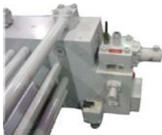
ex. 600-ton HPM