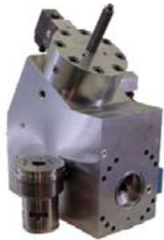
ex. 2500-ton IDRA